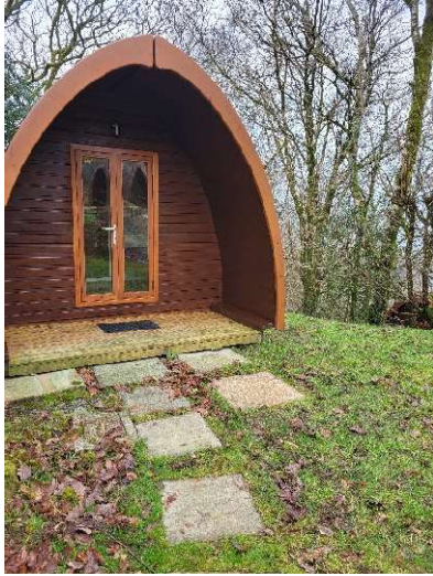
Family Comfort Pod 1