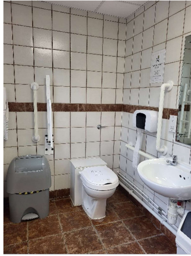
Wet room Toilet