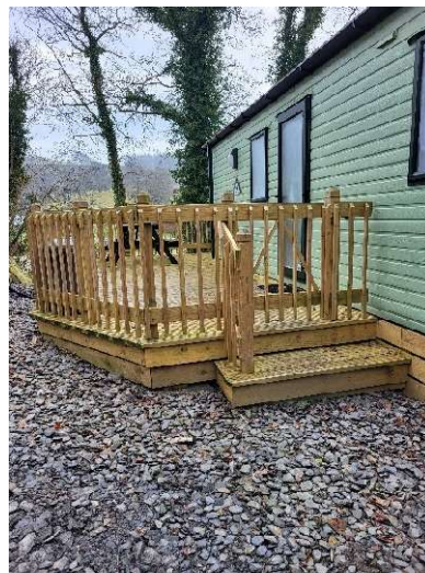
Hire caravan Windermere access