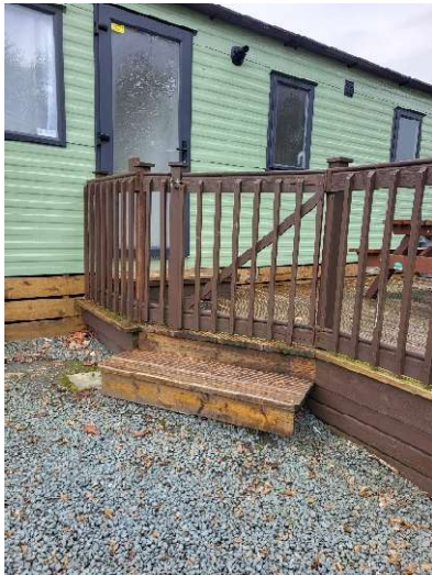
Hire caravan Rydal access