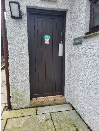
Ladies' shower entrance