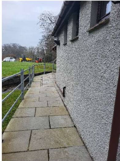
Level access to side of facilities building