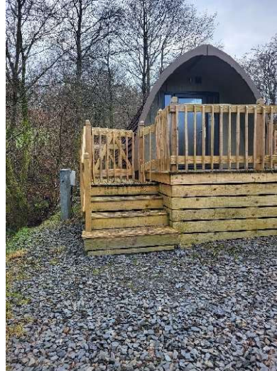
Deluxe Pod 1 access