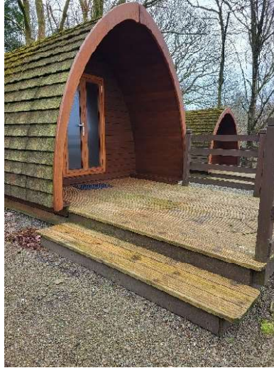
Family Pod 3