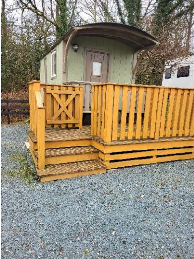
Shepherd's Hut access