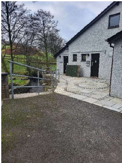
Level access to facilities building