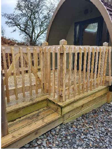
Deluxe Pod 2 access