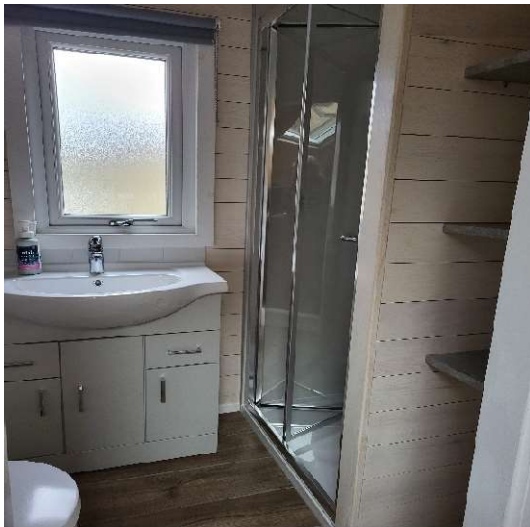
Deluxe Pod bathroom